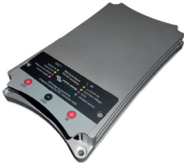
OUT LED indicator IN LED indicator