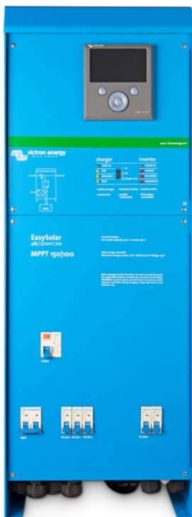
EasySolar 5 kVA

http://www.victronenergy.nl/support-and-downloads/software/