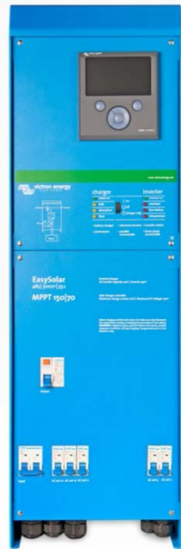
EasySolar 3 kVA