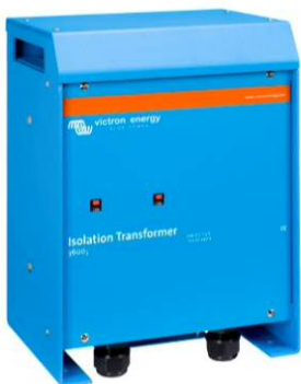
Isolation Transformer 3600W