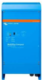
MultiPlus Compact 12/2000/80

When connected to the Ethernet, systems with a Color Control panel can be accessed and settings can be changed.